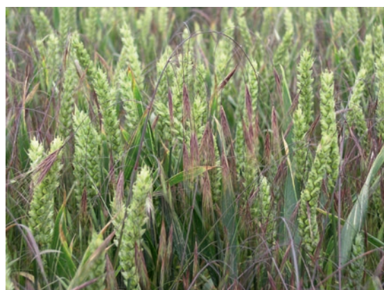
Sterile brome (barren brome)